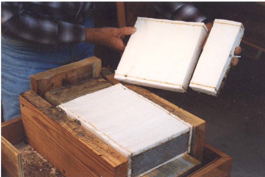
#64 TEST FIXTURE - Close-up shows no termite damage.