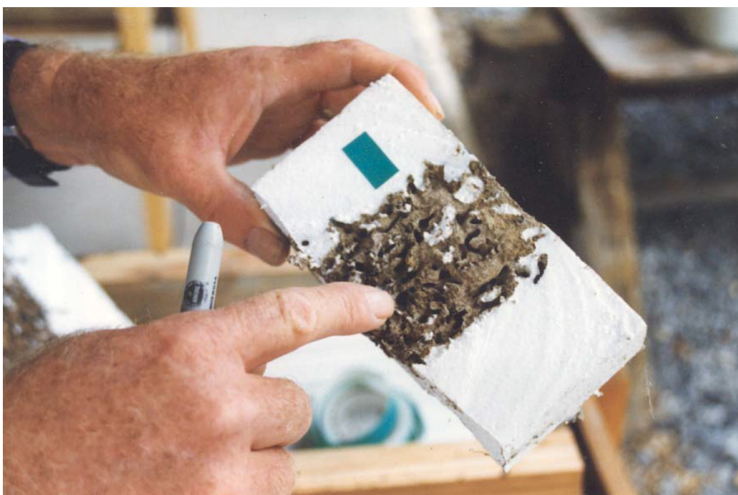
#45 TEST FIXTURE - Close-up shows termite nesting galleries formed in non-treated EPS.