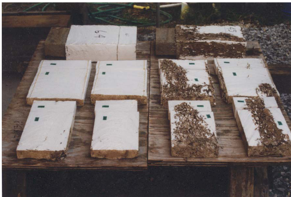
#64 TEST FIXTURE - ThermaFoam R-Control with Perform Guard and R-Control Do-All-Ply.