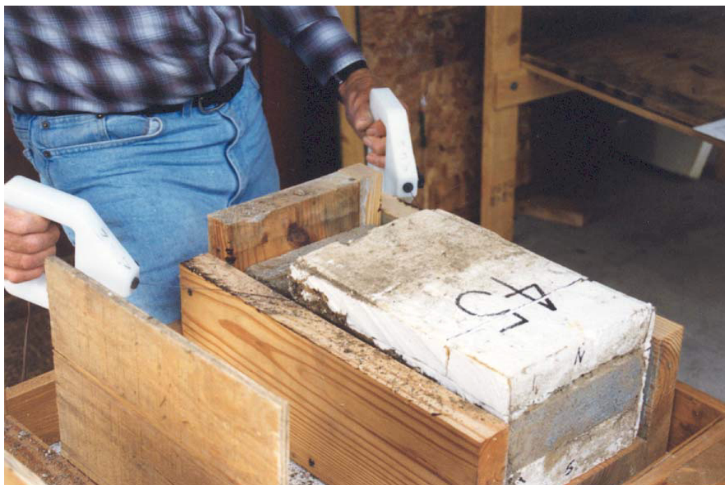
#45 TEST FIXTURE - Examination of of non-treated EPS after 3 years exposure. Highland Site, Mississippi.