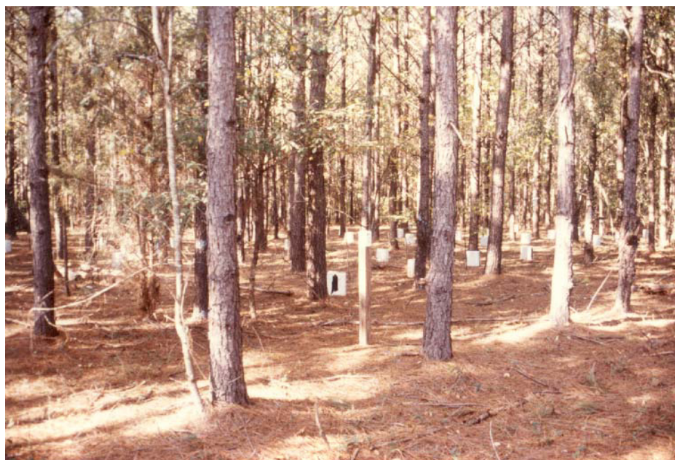
Field installation of test textures - Griffin, Georgia.