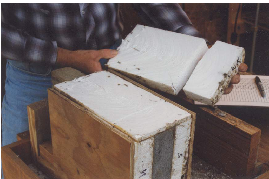
#64 TEST FIXTURE - Close-up shows slight termite damage.