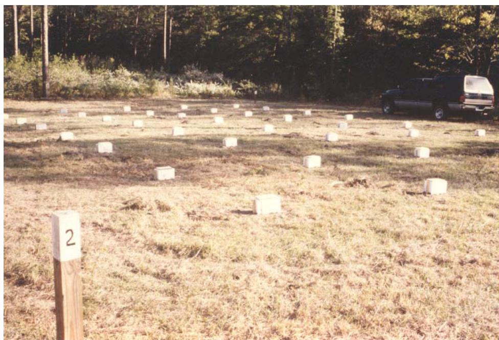
Field installation of test textures - Stone County, Mississippi.