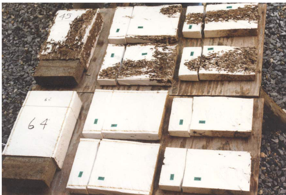
#64 and #45 TEST FIXTURES - Close-up comparison.