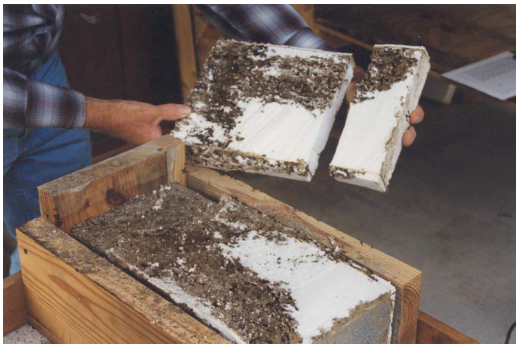
#45 TEST FIXTURE - cut open to reveal extensive termite damage.