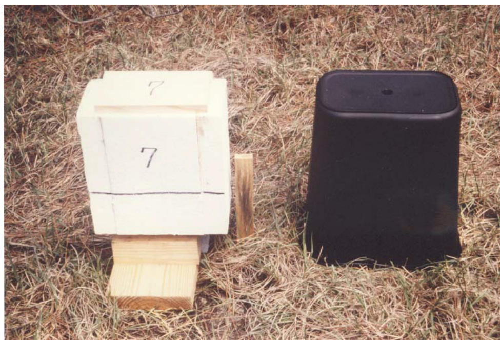
TEST FIXTURE - Prior to installation showing underground baitwood base to attract termites to site. Canister cover to protect termite activity.