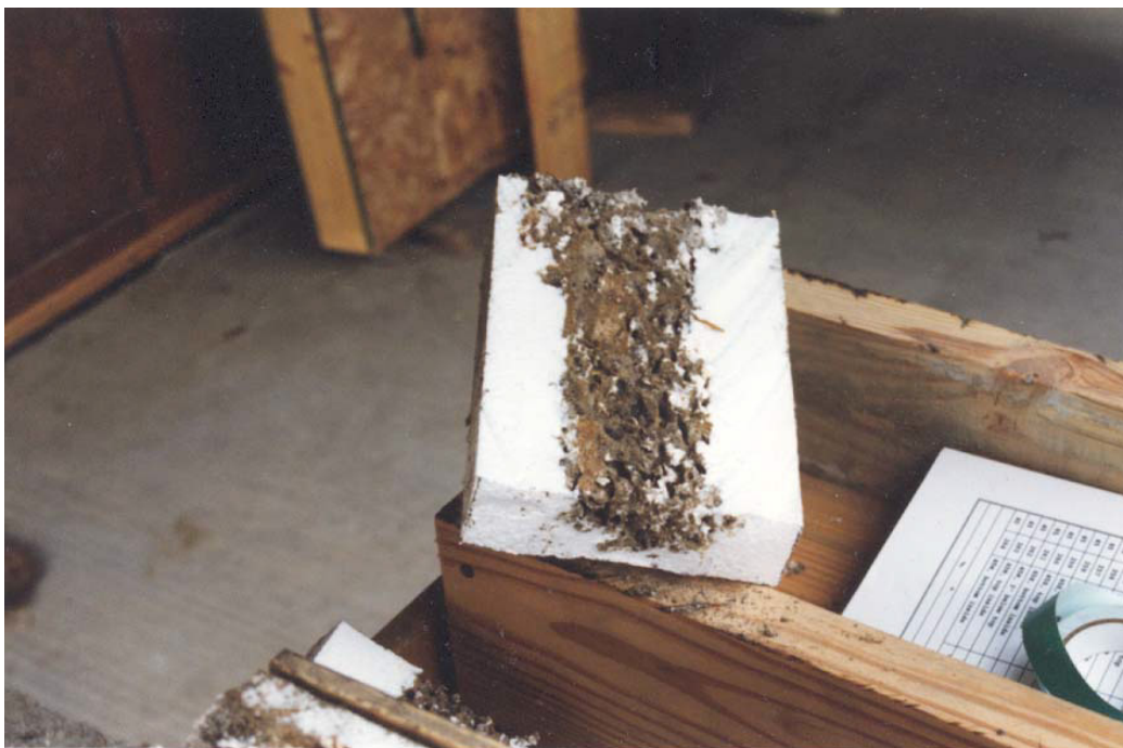
#45 TEST FIXTURE - Close-up shows nesting infestation of termites.