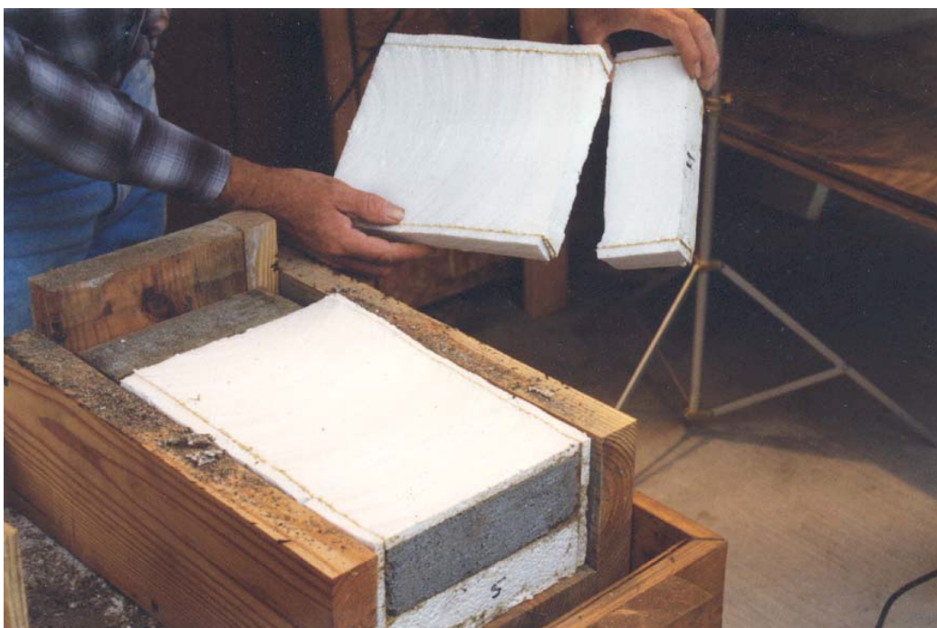
#64 TEST FIXTURE - cut open to reveal limited termite damage.