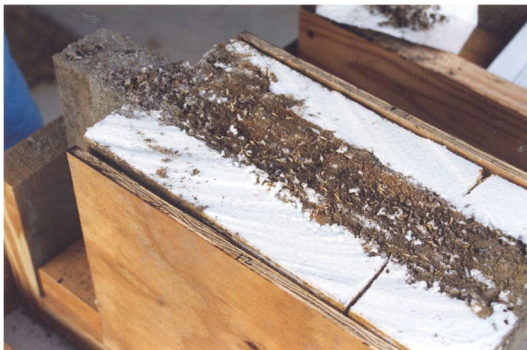
#45 TEST FIXTURE - Close-up shows active termites.