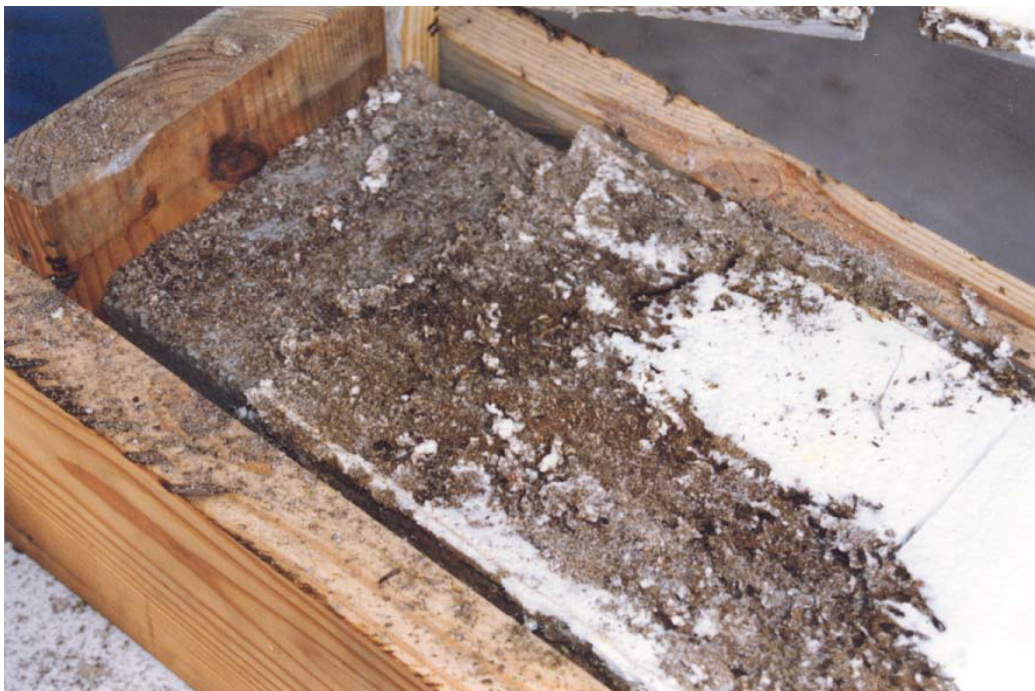
#45 TEST FIXTURE - Close-up shows extensive termite damage.