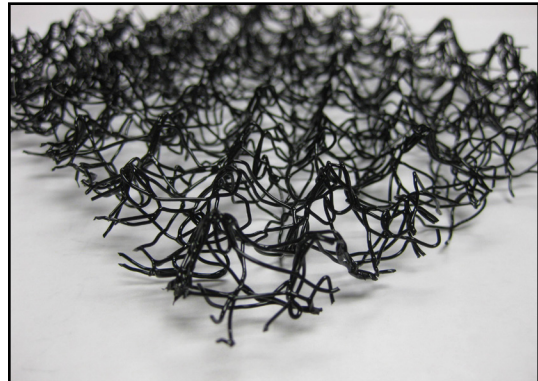
Enkamat 7020 from Colbond

do not fail under the load of the roof and the rigors of the construction environment, including construction foot traffic. The space created between the R-Control SIP roof deck and the roof covering will allow moisture to flow away or evaporate.