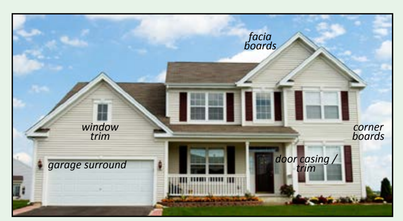
When appropriately primed and coated, FrameGuard® Total™ wood is a beneficial choice for exterior trim.