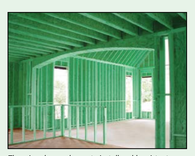
There is only one chance to install mold-resistant wood: when the home is built. The FrameGuard® treatment prevents mold growth and thus reduces airborne mold spores.